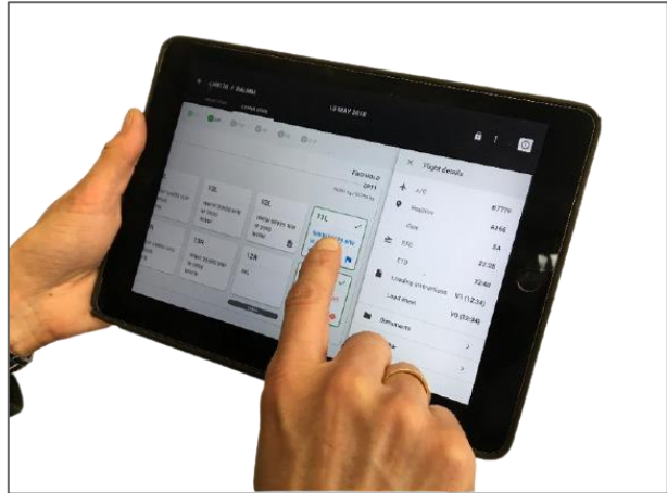
NetLine/Load MobileSolution : Highly user-friendly loadplan view via tablet or smartphone

is designed for mobile devices, allowing the ramp agent to update the system directly from the apron. As a result, the load control process is more efficient and less error-prone. A chat functionality enables the immediate exchange of information.