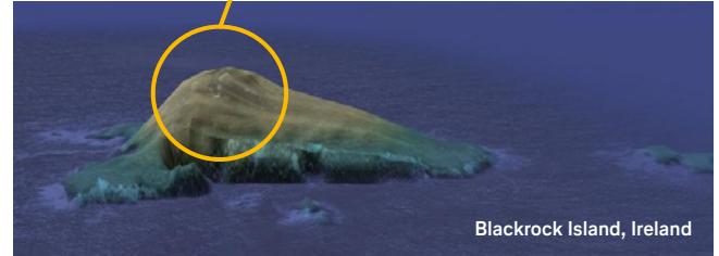
Lido Surface Data NEXTView