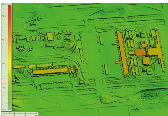
Increased safety with the incorporation of highly accurate airport details.